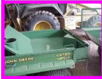
The new ballast dump bins mounted on the Gators.