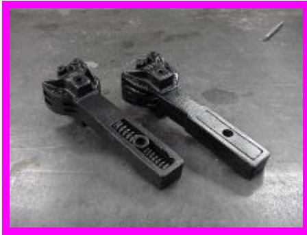
The 'Mercer' style on the left and the Train Mountain coupler on the right.

The history of 1 1/2 inch scale couplers is on display in the BackShop at Train Mountain. These were the pieces that were examined and used to help Train Mountain design their own coupler. Train Mountain uses these on all their cars. As a result they also have some for sale along with the couplers they replaced with the new Train Mountain coupler. Both of these are available through the Company Store.