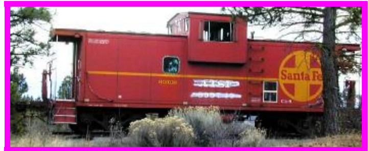
A Santa Fe extended vision style caboose up on Caboose Ridge