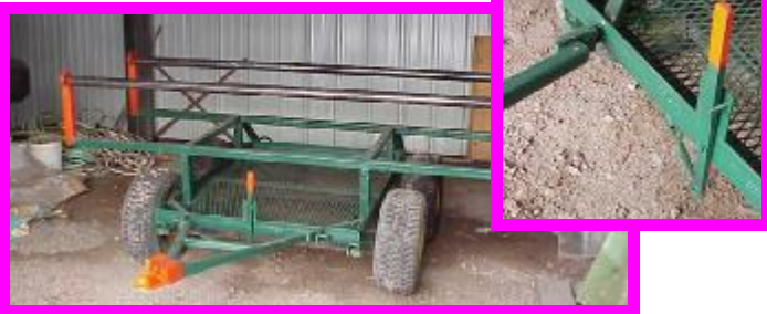
The new track plastic dispenser in the new portable size! And in keeping with the times even the dispenser has brakes!

Now is Dick really working or just making sparks to impress the boss? When Dick is not at Train Mountain he is restoring a couple of Cameros and one super hot pickup truck!