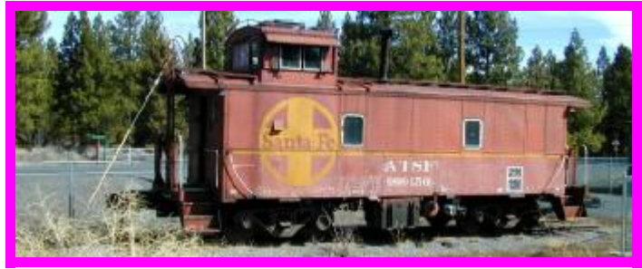
A Santa Fe cupola style caboose