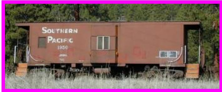
A Southern Pacific bay window style caboose