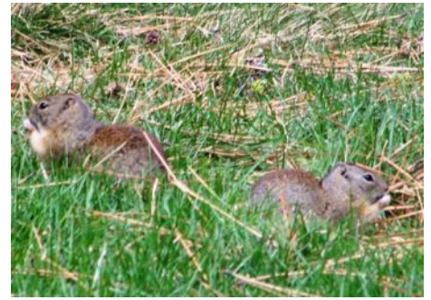
And then there are the squeakers! So where is that cat now?

Enjoy your lives; it's the only one you get.