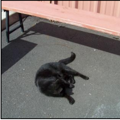
The Backshop cat lays on the macadam outside the building to absorb the warm rays of the sun

There are a few signs of spring popping up; we relish each and everyone of them, since they seem to be far and few between. You know it's spring when: