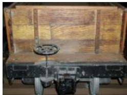
Drop down brake wheel

$800 Steel frame easily Converts to flatcar