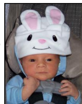
He was the cutest little bunny for Easter.

Tom Veltman sent me a very cool train email. I did some searching and you too can see it by going to: http://www.slideshare.net/renatal123/eleznice . It's not too long, but it's just gorgeous pictures of different trains in beautiful settings. I think each photograph is frameable,