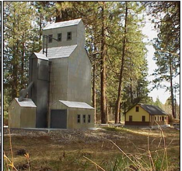
And from the back side