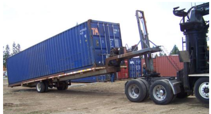
Another container arriving