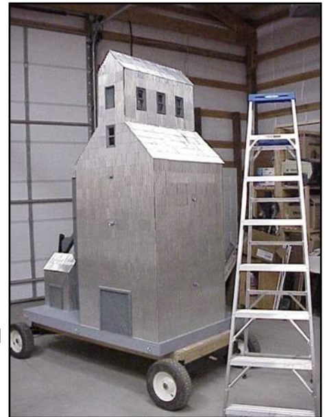
Russ' new building under construction

Remember ladies , Thursday is your day at any of the Train Mountain Work Weeks. Come to the Hall of