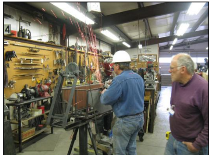
They worked so hard they made sparks fly!