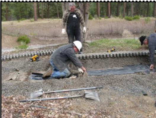
Kitsap Week 2010