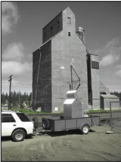
On its way but a quick stop first

Last thing is to make sure you let the office know if you are coming to any of the Banquets for any of the meets. They need to know ahead of time, not after you arrive.