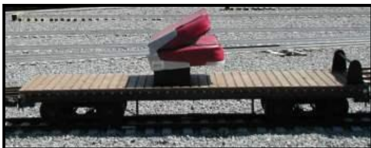
6' FLAT CAR WITH PASSENGER SEAT $1,500.00 EACH