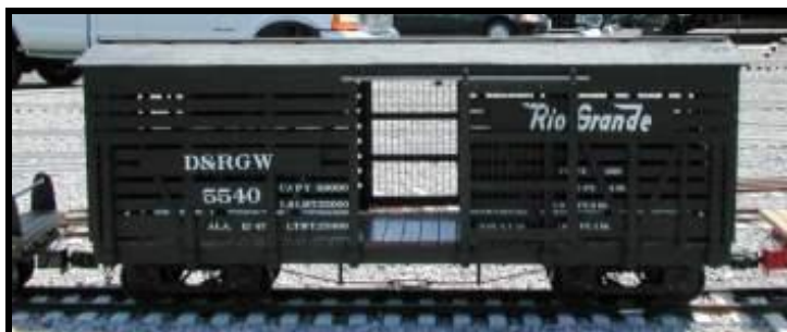
STOCK CAR $3,150.00