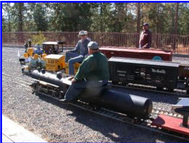
Did I mention we had some steamers at this meet! There was big ones, little ones, and some in between.