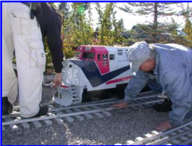
We even had a great demonstration fo rerailing a large locomotive during the meet.