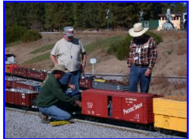
The theme of the day was picking up and spotting cars at all the spurs on Train Mountain, Great Fun!