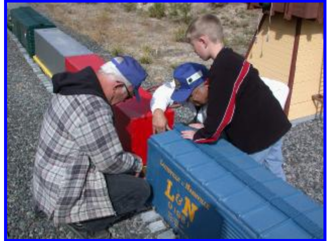
Safety cables had to be connected to move a train.