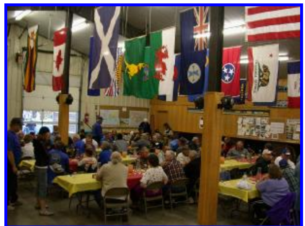
The large crowd at the Saturday Banquet shows how well attended this meet really was . Good meet, good food, good friends!