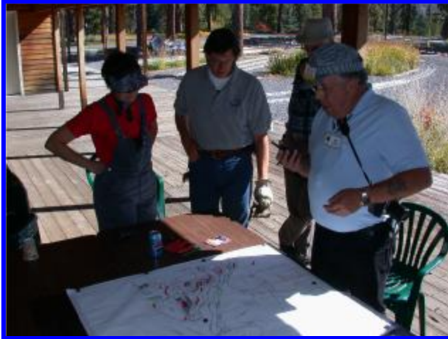
The dispatcher was very busy keeping track of the fun!