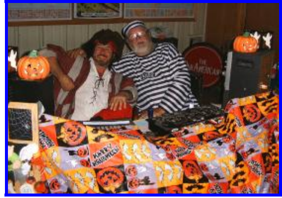
Pirates of the Chiloquin and the boy's later in the evening