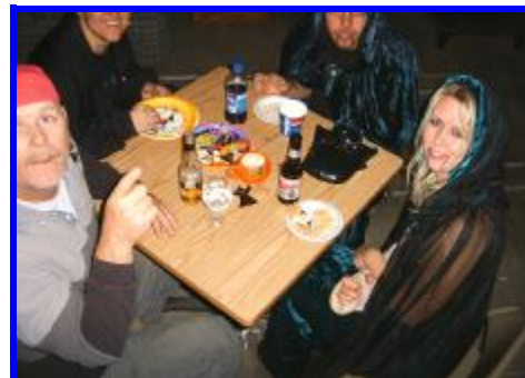
The party is a great chance to relax and enjoy yourself and the great company, such fun!