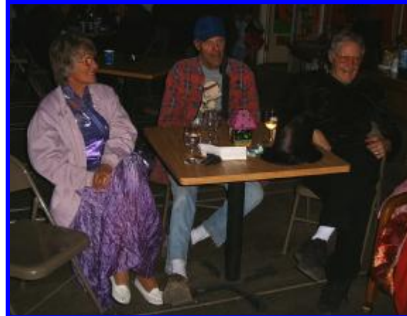
They let me out in time for the party, along with some more of the 'locals'!