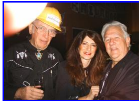
The hostesses and the movers and shakers.