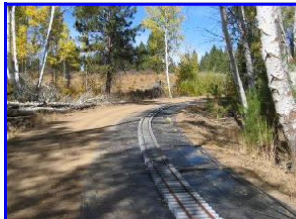
Yard area at Sheep Station