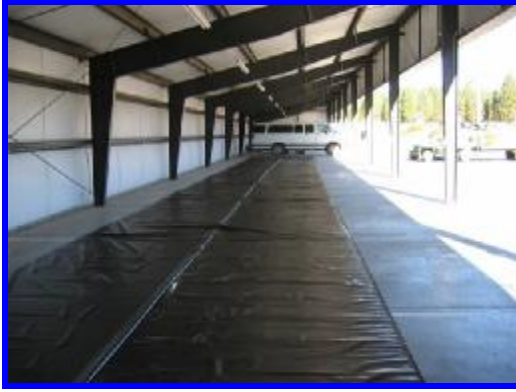
Prepping the plastic underlayment