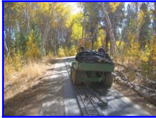
Taking the Plastic out to Aspen Grove Loop