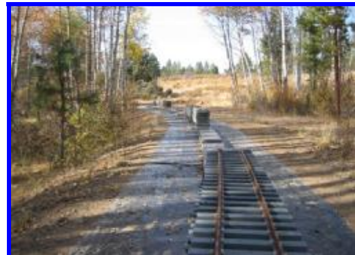
Coming in to the yard area