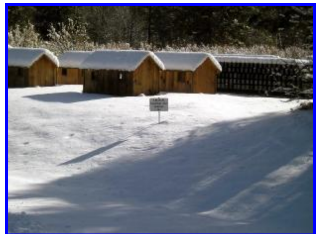
The miniature buildings at Train Mountain always look good but during the winter season with a little bit of snow they look great! The logging camp at Steuer Siding.