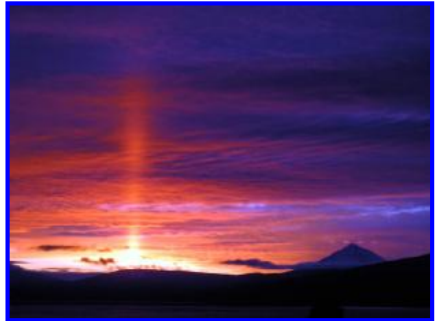
How's this for a pretty sunset? Looks pretty good to me!