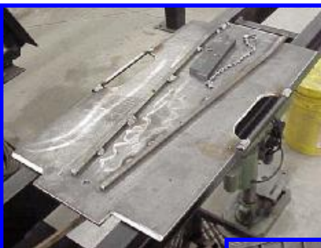
Lee Brooks' much improved loading plates for use on the Crisp Yard lifts. Now that's heavy duty!