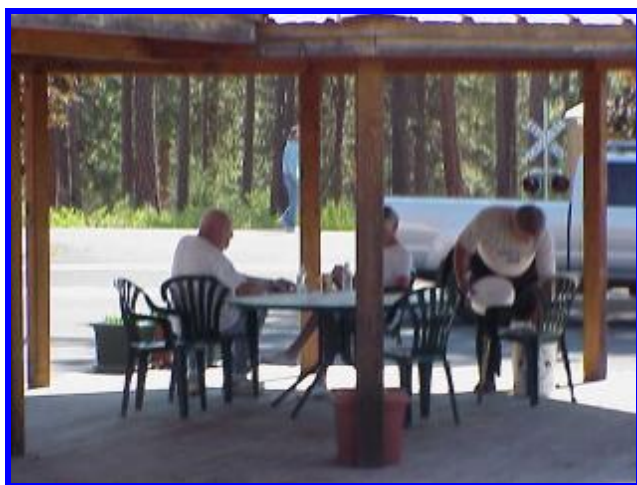
When not running trains some members took shelter in the cool shade of the gazebo's at Central Station.

Please Help the Hosts and Hostesses by signing up for those dinners you wish to attend. These nice folks need to know how many are coming! Sign up in the Central Station Office as soon as you arrive.