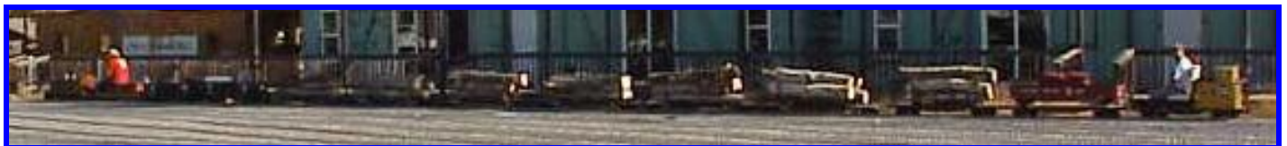
A log train running during the meet, from Aspen Loop to the Fire Pit!

And then all you need is people to run em'! And people we had, lots of em'! What a great 20th anniversary celebration and meet! What fun!