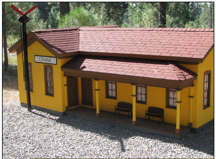
Beautiful Job, Volunteers!