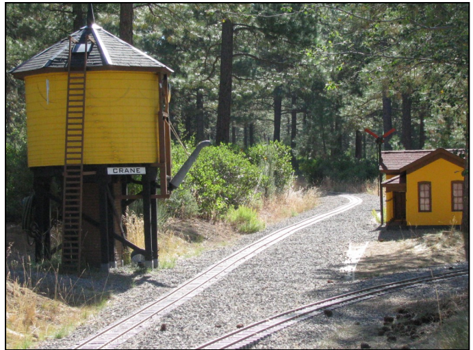
New Addition To Crane Siding!