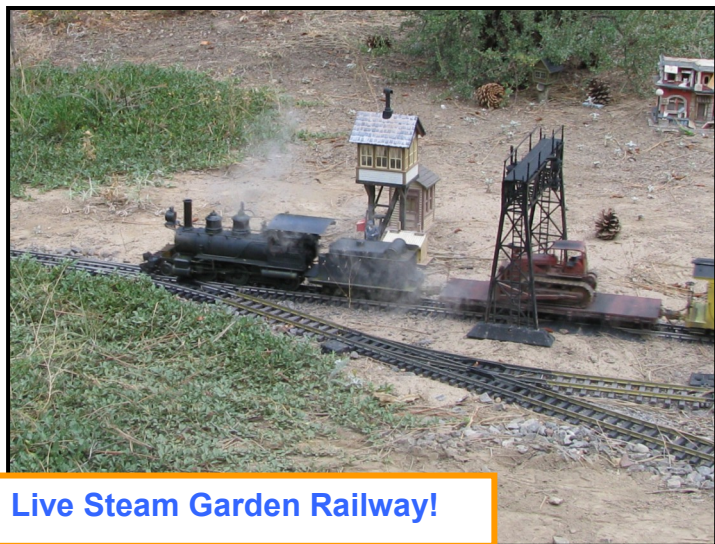
Live Steam Garden Railway!