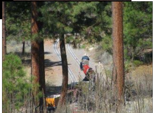
Heading up for another load....