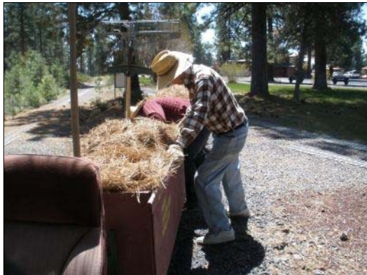
Moving and Dumping

Much Work, And long Hours, Tired and Satisfied Volunteers Do make!