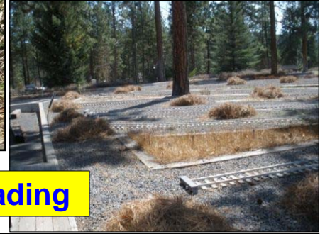
Raking and Loading