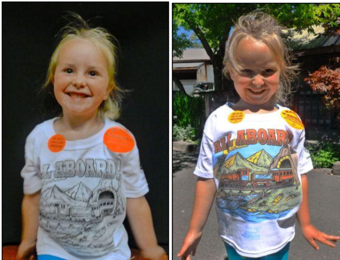
T-shirts and Bags change to color in the sun!!