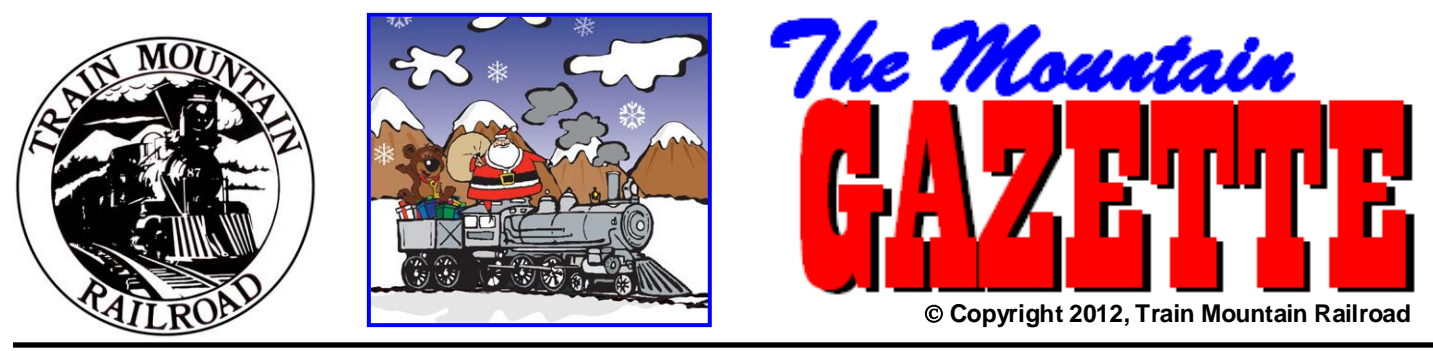
An Official Members Only Publication of the Train Mountain Railroad Issue: Vol. #2 Issue #2 December 2012