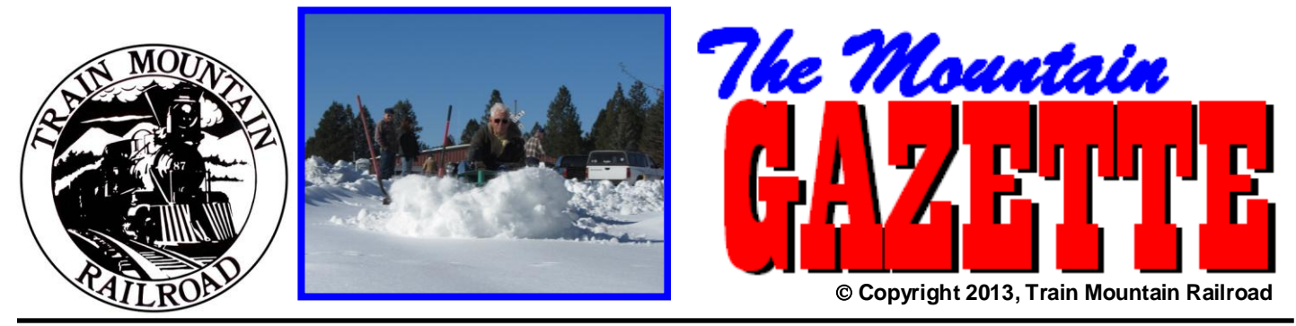
An Official Members Only Publication of the Train Mountain Railroad Issue: Vol. #2 Issue #3 >Ubi Ufm2013

You folks really missed it! Missed what you ask? The Polar Bear Meet has come and passed. For the few that came it appears they had a great time. See the article in this issue for all of the gory details!