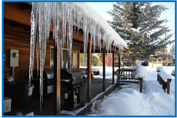
So how cold was it? Take a look!