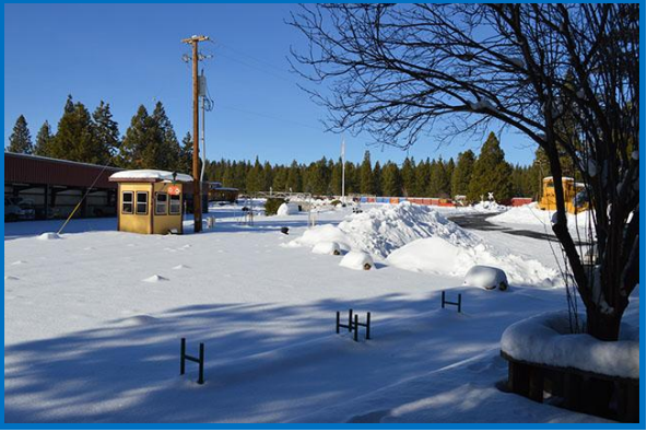
Central Station did NOT get plowed!