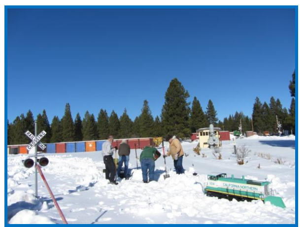
The Motley Crew!