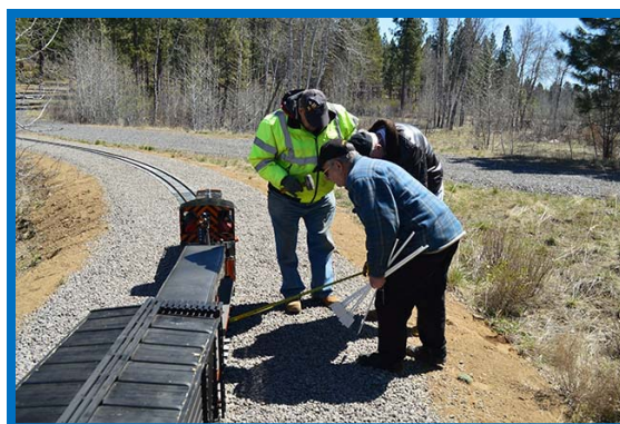
Pardon the expression but I think this is a picture of the Kitsap Krew getting organized, I know, but it does look like it, doesn't it! 😊 Next is them actually using a measuring tool and we have a pictures to prove it! Just kiddin' of course!