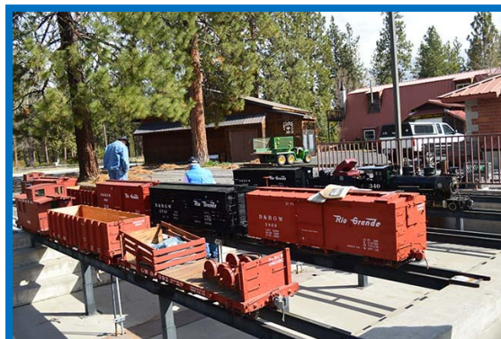
The Kitsap Krew arriving for their annual work week. A really nice set of trains to run. They also used them for their work week projects of which there were many.