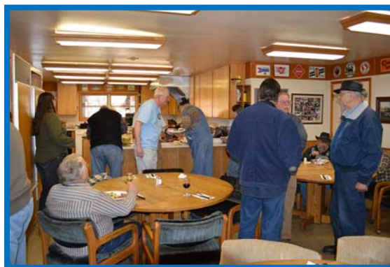
Out in the woods setting the new milepost markers. They also spent some precious moments of their time relaxing at Central Station and enjoying the food and comradeship.