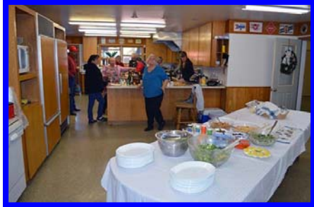
The locals decided that there were many of us that were not going away for Christmas so they had a no host Christmas Day dinner. 30 folks showed up for some great food and fun ( and some killer desserts! )