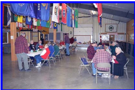
Good food, good friends, great time to be at Train Mountain.