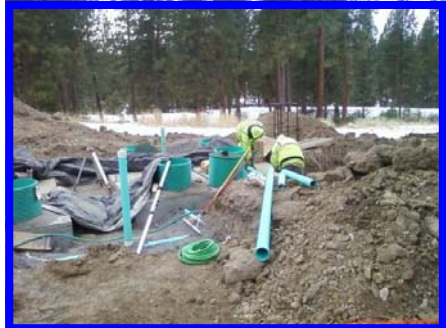
Yes Virginia there really is a Santa Claus and yes the new septic system is really being installed!