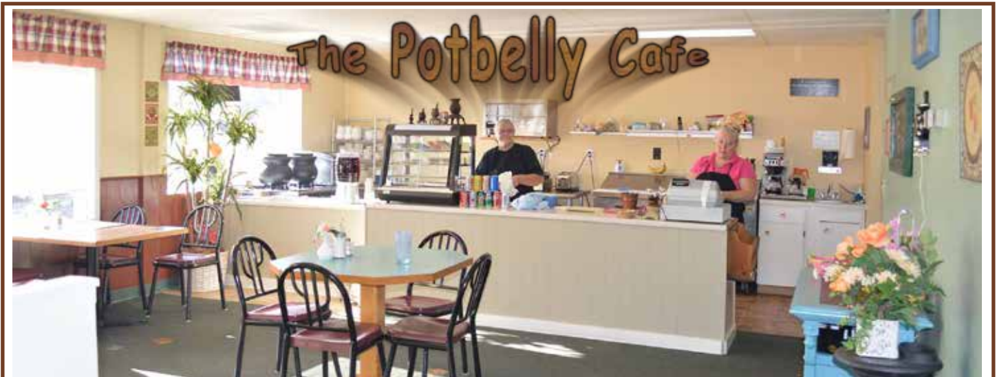
Located only 1.5 miles off Hwy 97 in Downtown Chiloquin in the same building as the Post Office 212 1st Avenue, Chiloquin, OREGON 97624 -- Phone: (541) 783-2268