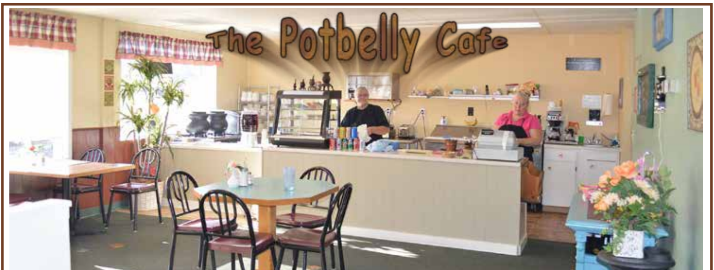
Located only 1.5 miles off Hwy 97 in Downtown Chiloquin in the same building as the Post Office 212 1st Avenue, Chiloquin, OREGON 97624 -- Phone: (541) 783-2268