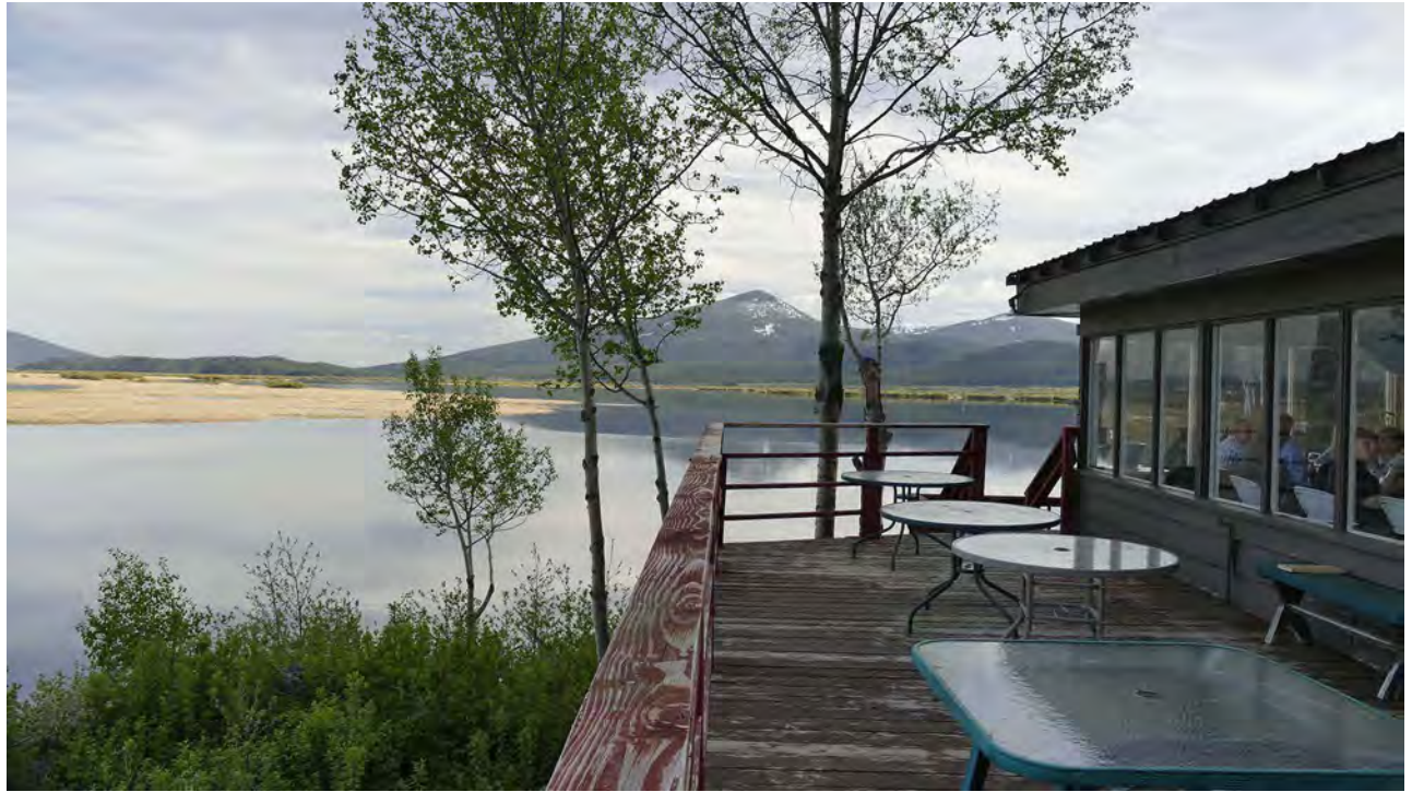
Dinner at the Rocky Point Resort.