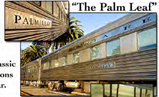
"The Palm Leaf"