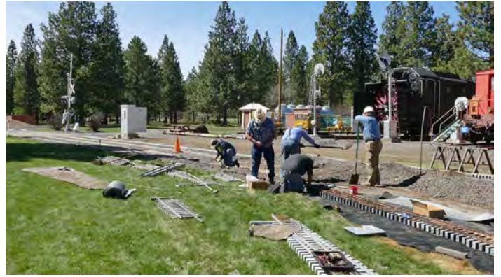
Cleaning up the mess