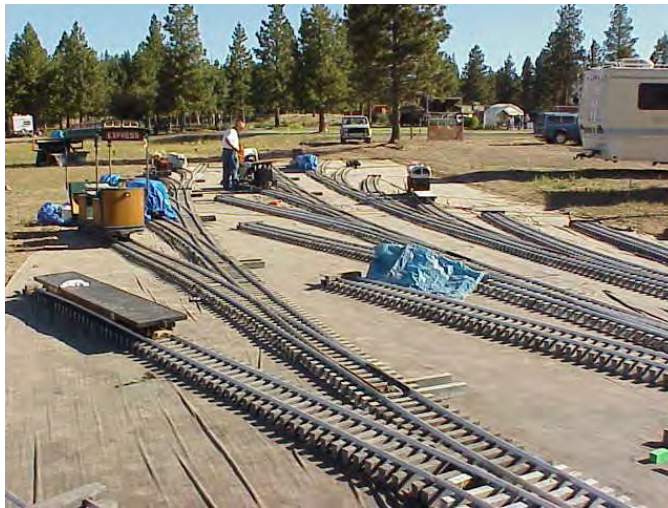
Old Thursday Yard:

Anyhow bottom line, don't be surprised at what we come up with because we want everyone to have a fun, safe, and convenient time on the Mountain. We'll get ya' a parking place, somewhere!