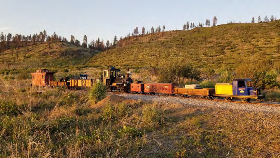
Hope Circle, late afternoon.

This is an exciting opportunity for people to experience the grandeur and adventure of Train Mountain!