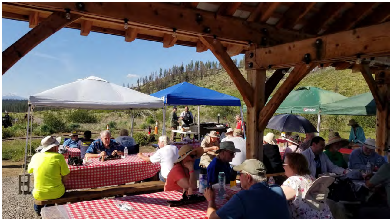
Hope Shelter dedication party.

Your support of the Visitor Center is greatly appreciated.